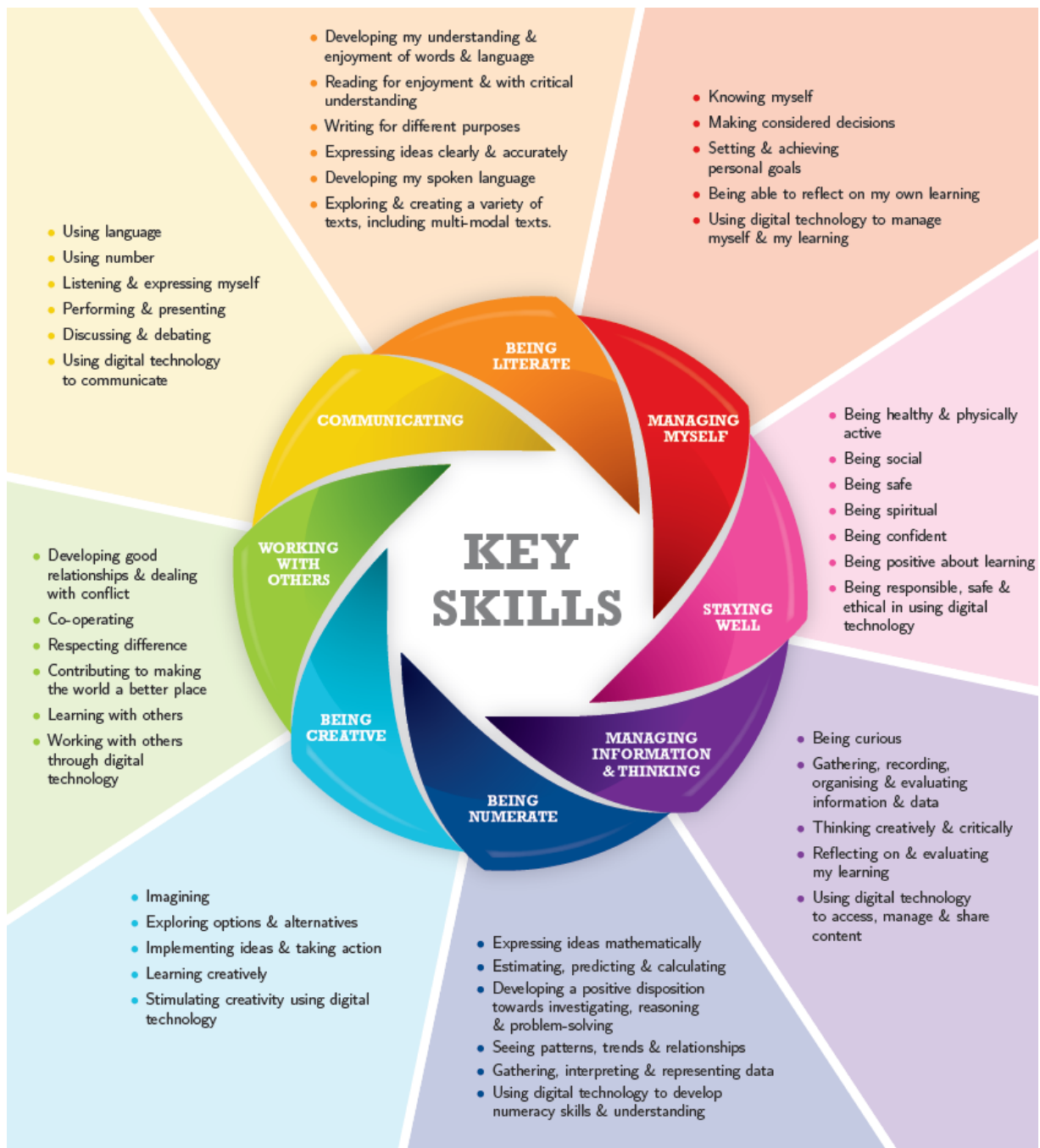
Figure 1 Junior Cycle Key Skills